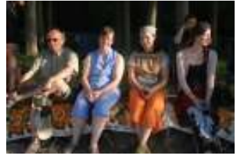
Picnic on the Danube river

On the Sunday evening we ate with the Lom fellowship in the church and received feedback about our week with them. It was very moving to hear how encouraged in their faith their young people were from spending time with our young Christians.