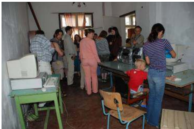
Inside the Belogradchik orphanage.

One day, all of us and many of the Lom fellowship went to